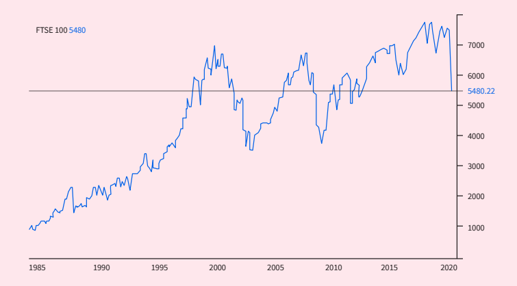
Chart: FTSE 100 from inception to March 2020 https://tradingeconomics.com/united-kingdom/stock-market Not the first FTSE 100 dip

Created in 1984 with a starting level of 1,000 points to provide a wider index of leading shares quoted in London, the FTSE 100 largely superseded the narrower Financial Times 30-share index launched in 1935. As a barometer of economic outlook and corporate prospects, the FTSE 100 has gauged a few storms over the past 36 years. A chart of its progress reveals a plethora of spikes and dips, the starkest of which can be associated with key events in recent financial history.