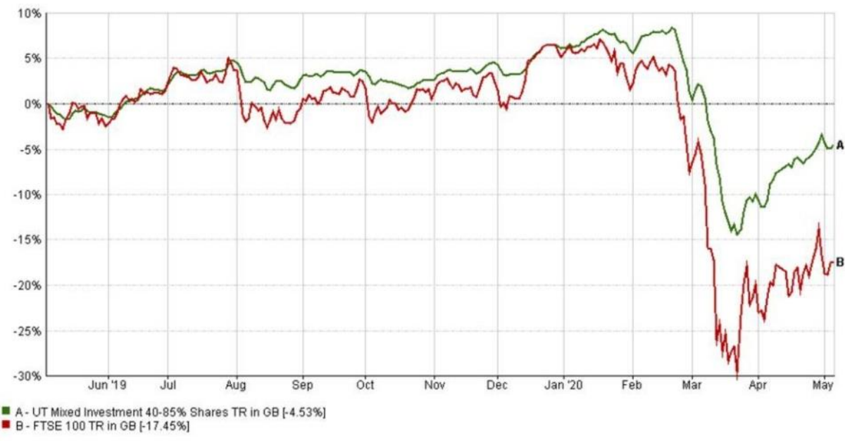
For Balanced (using the IA sector – Mixed Investment 40% to 85% Shares), a typical Balanced investment will have fallen by between 4% and 5% over the last 12 months (Source: FE Analytics as at close on 6 May 2020).