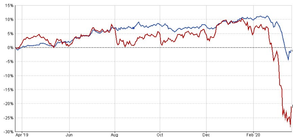
■ A - Openwork Graphene C1 Cautious Model Portfolio 27/03/2019 TR in GB [-0.84%] ■ B - FTSE 100 TR in GB [-20.91%]

If you are a Cautious investor, you have been protected from the extreme falls of global equity markets. In fact, if you are invested in the Openwork Graphene C1 Cautious Model Portfolio, your investment will have fallen by less than 1% over the last 12 months, compared to the FTSE 100 which has fallen by over 20%