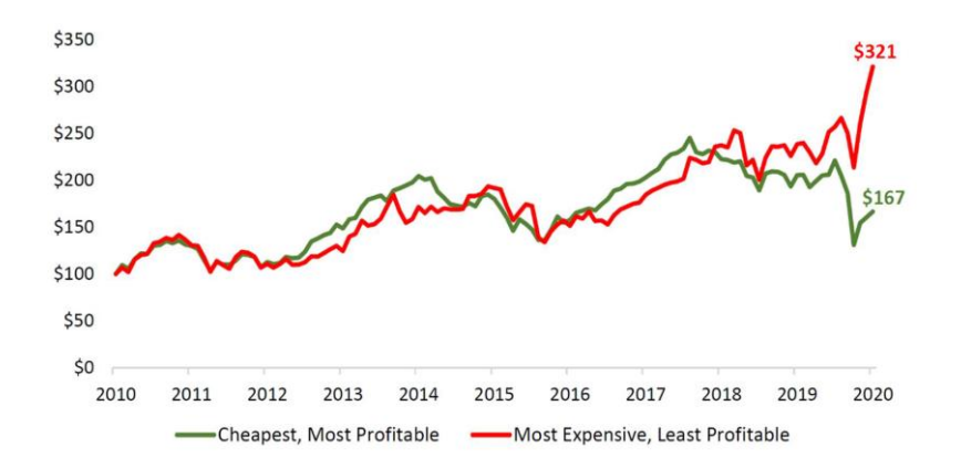
Growth of $100 in global developed equities from 2010 to 2020

However, in the last 10 years, this trend has reversed. $100 invested in the cheapest companies would have turned into $167 today, while the same amount invested in their pricier peers would be worth $321.