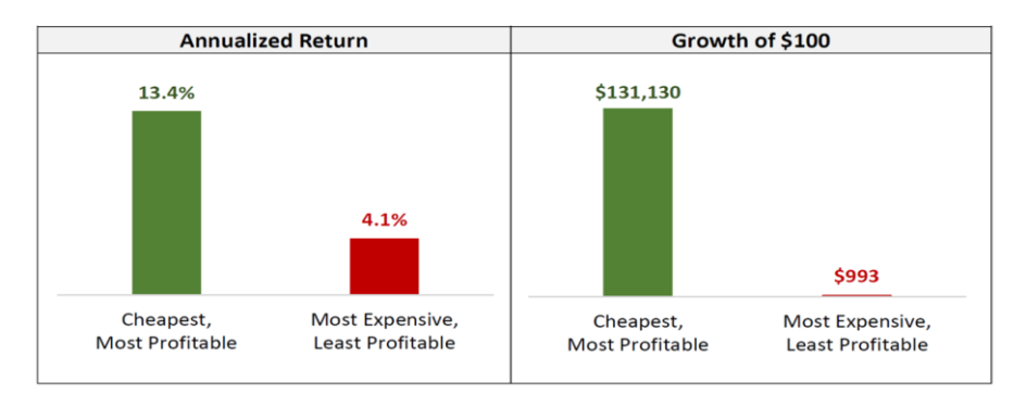
Long horizon investor outcomes, US equities from 1963 to 2020

Traditionally, US companies with the cheapest share price but generating the most profit have outperformed those with relatively expensive shares but lower profits. The difference in returns is stark. As you can see from the chart below, if you'd invested $100 in the cheapest companies in 1963, when records began, it would be worth $131,130 today. In contrast, a $100 investment in the most expensive would have returned $993 over the same period.